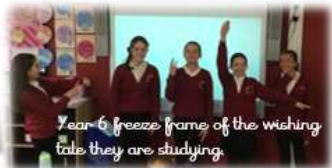
Year 6 freeze frame of the wishing tale they are studying.