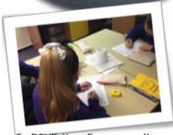
In PSHE Year 5 were recalling all their skills they have learnt since starting school.