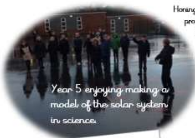
Year 5 enjoying making a model of the solar system in science.

The lively energy and excitement of 5/6C in our first full week back following the holiday break has set the tone for an exciting and successful term ahead. Their learning has been driven by enthusiasm and dedication, encompassing both interactive discussions and practical exercises. First up for the week was English. Year 5, who were tasked with creating a set of guidelines for capturing ogres, bears, and other characters from their games. Year 6 were beginning their wishing tales and finding the features needed to create their own in the coming weeks. With engaging group projects and solo tasks, 5/6C demonstrated a remarkable spirit of cooperation and tenacity. Every day was full of opportunities for development and success, whether it was exploring the depths of space, or getting to grips with evolution in science, or learning how to solve fractions or ratios in maths, to expressing creativity via computing. It is evident from the wide range of tasks completed in just one week that 5/6C is prepared for an engaging and fruitful learning journey in the upcoming months.