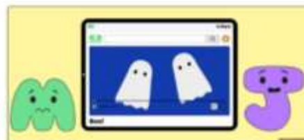
This one is not about penguins, it is scary.

As part of Online Safety Week, we have learned about the things we can do to stay safe when playing games and watching videos. They know that if something makes them feel sad, scared or worried, they can stop watching and tell an adult.