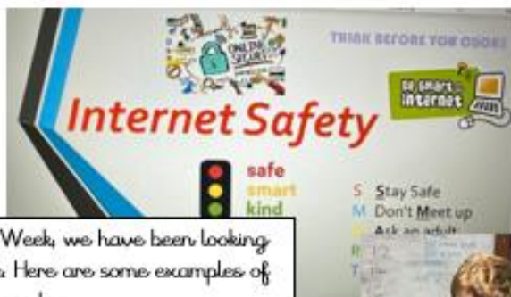
As part of Internet Safety Week, we have been looking at ways to stay safe online. Here are some examples of our work.