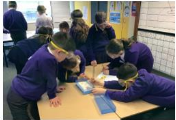
The Year 5s have been experimenting making craters in Science. We loved using the goggles!