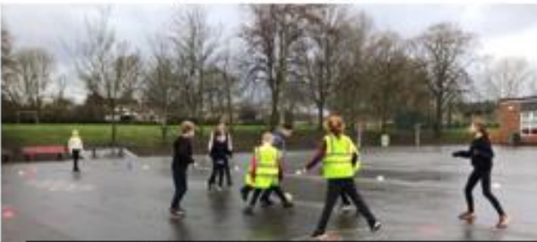
The 5/6T Football Cup was a massive success! Congratulations to Team 1, who were unbeaten. Well done to the players who won special awards for their sportsmanship.

We have had yet another busy week in 5/6T. Here are some of the things we have been up to: