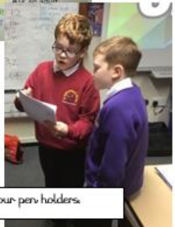
Customer surveys in DT for our pen holders.